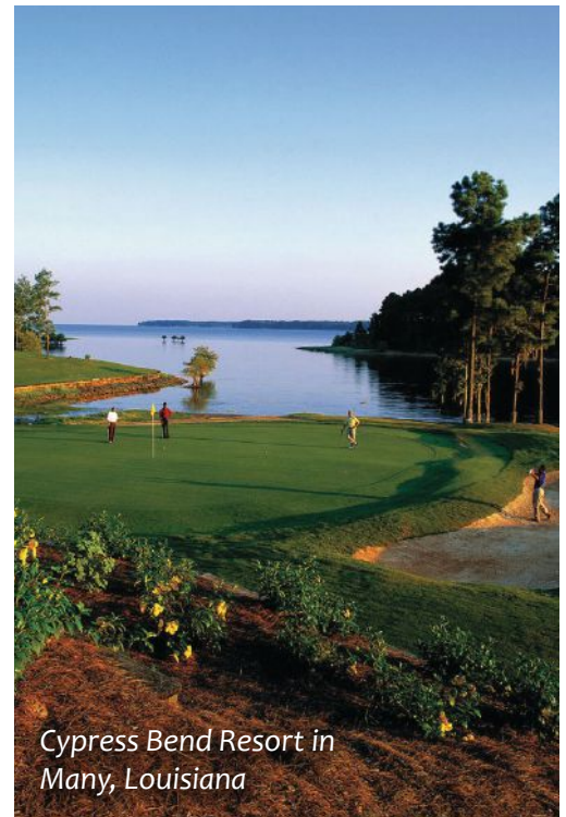
Cypress Bend Resort in Many, Louisiana

start before you even tee it up. The Golf Club at Audubon Park is the only course in America where you can take a streetcar from most points in the city and find yourself on the links. At only 4,200 yards and par-62, it's a must play when near the Big Easy thanks to its tricky bunkering and small push-up greens that are always in great shape. Plus, you'll get to check out a truly historic part of town, from Tulane University to the city zoo. Rates start at only $25, leaving you plenty of sight-seeing money left over.