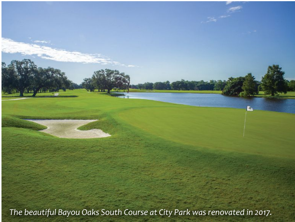
The beautiful Bayou Oaks South Course at City Park was renovated in 2017.